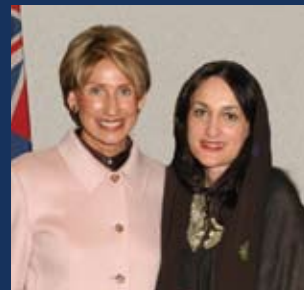
Barbara Barrett – Campaign Thunderbird Chair, Current Thunderbird Board of Trustee Member and Former Board Chair